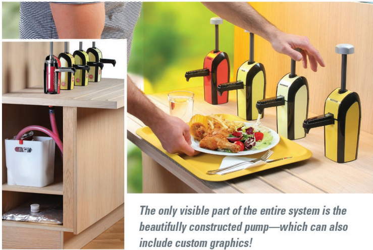
The only visible part of the entire system is the beautifully constructed pump—which can also include custom graphics!

Simplify your condiment station with Nemco's In-Counter Dispensers powered by Asept. Using a simple mechanical dispensing system (No CO 2 !), the in-counter design opens up the condiment station by placing the product pouches under the counter.