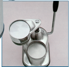
TOP VIEW OF 11426