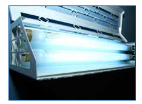
Two high-intensity UV bulbs attract flying insects over an 1800 sq./ft. area