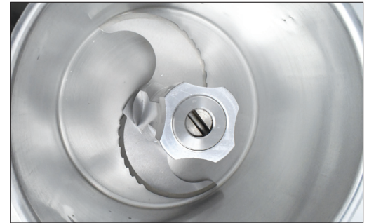
4Cr13 stainless steel knife provides excellent resistance to corrosion and hot oxidation