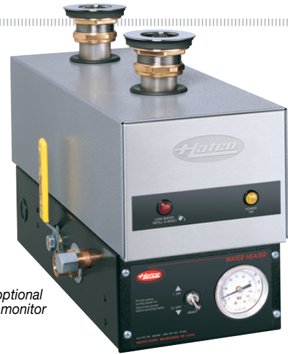
3CS-9 with optional temperature monitor