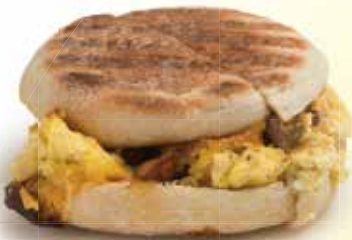
Sausage & Egg Muffin

Top and bottom plates are available with grooved (for grill marks) or flat-surfaces in your choice of pairings. Specify top and bottom flat, top and bottom grooved, or one of each, with the grooves on the top and a flat bottom