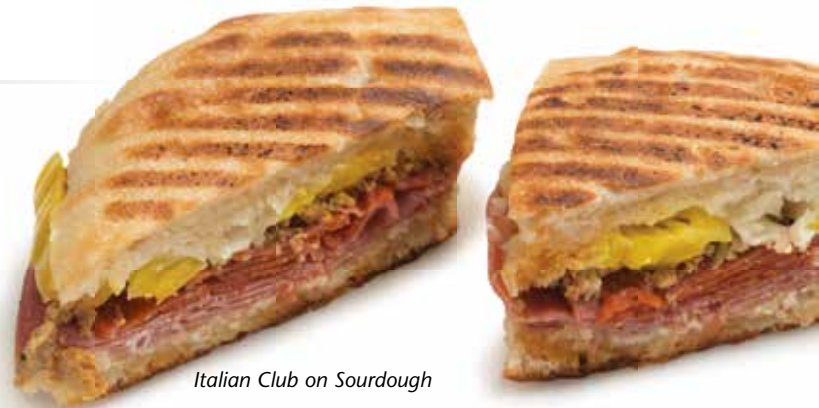
Italian Club on Sourdough

NEMCO reserves the right to make design, specification or model changes without notice.