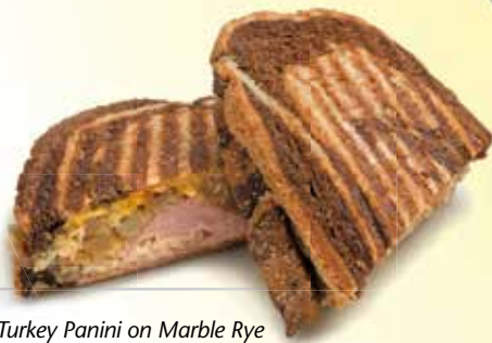
Turkey Panini on Marble Rye

Both the upper and lower plates can be independently set to temperatures of up to 500° F