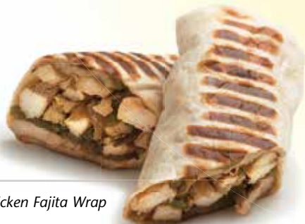
Chicken Fajita Wrap