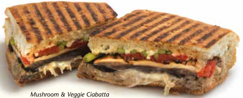
Mushroom & Veggie Ciabatta