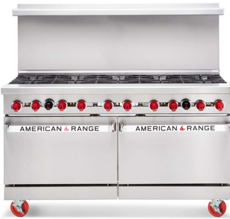
Model AR I 2G-8B Shown with optional stand & casters.

The Heavy Duty Restaurant Range Series by American Range was designed for continuous rugged use and performance. All the latest technology is incorporated to give you the best value for your money.