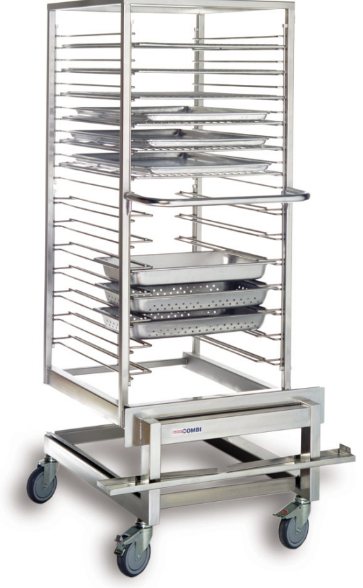
TC-14 Trasnport Cart