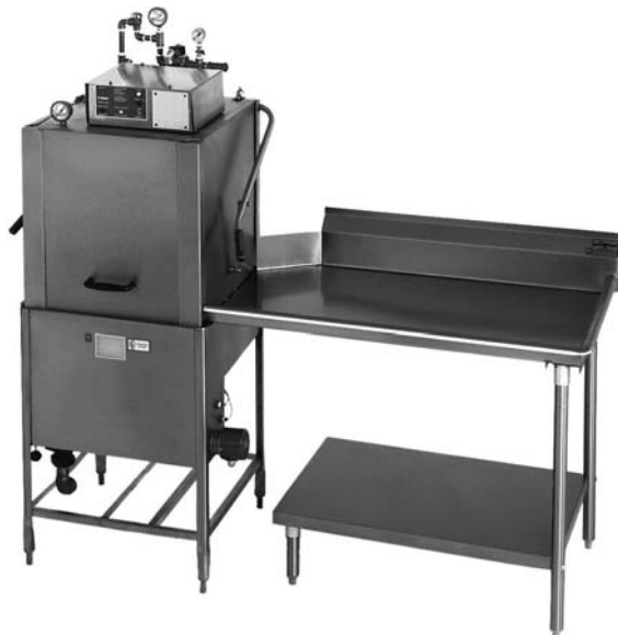
right-hand model shown with optional undershelf * (dishwasher not included)

Eagle Clean Dishtables, model _____. Top to be 16/430, 16/304, or 14/304 stainless steel, with all seams welded, ground smooth, and polished. Front and ends to have 3"-high upturn with 1½"-diameter rolled edge. Galvanized hat channels welded to underside. Backsplash is 8"-high, 20½" standard opening for dishwasher. Legs to be 1½" O.D. galvanized tubing, 1" diameter crossbracing and adjustable bullet feet (14/304 models come standard with stainless steel hat channels welded to underside of table, stainless steel crossbraced legs, and adjustable metal feet).