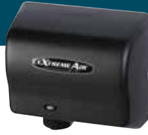
Steel Black Graphite