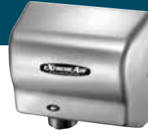
Steel Satin Chrome