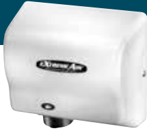
Steel White Epoxy