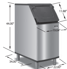
D420 383 lbs. (174 kgs)