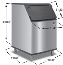
D570 532 lbs. (241 kgs)