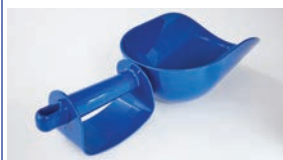
Ergonomic NSF approved sanitary ice scoop included