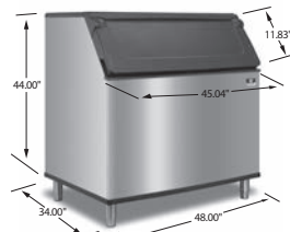
D970 882 lbs (400 kgs)