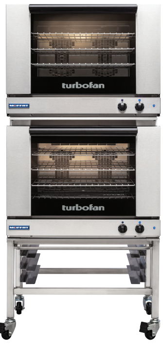
Model E28M4/2C shown

Full Size Manual / Electric Convection Ovens Double Stacked on a Stainless Steel Base Stand