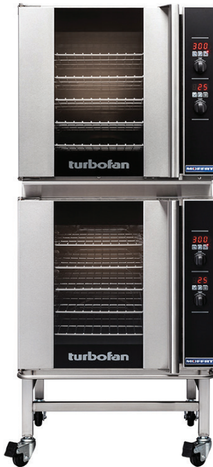
Model E32D5/2C shown