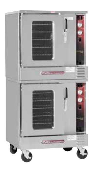
EH/20SC shown with optional casters