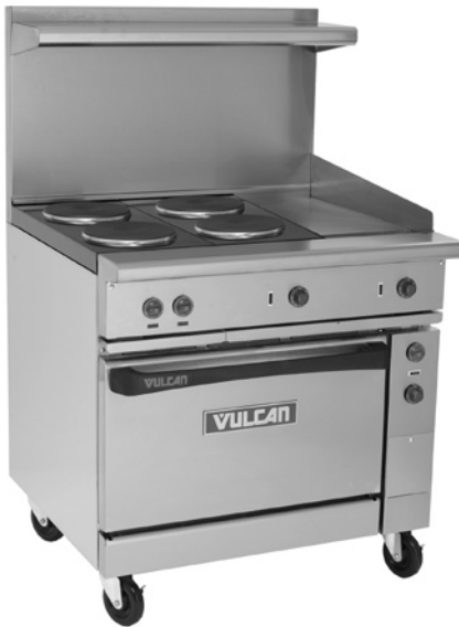
Model EV36-S-4FP-12G-208 shown with optional casters