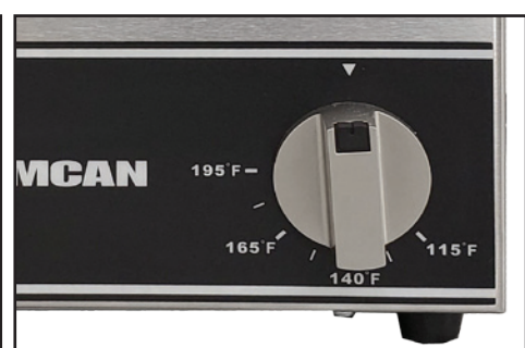
Designed for easy use with just a flick of a switch.