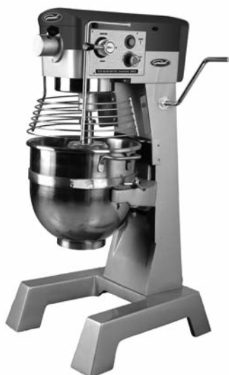
GEM130 30 Quart Mixer