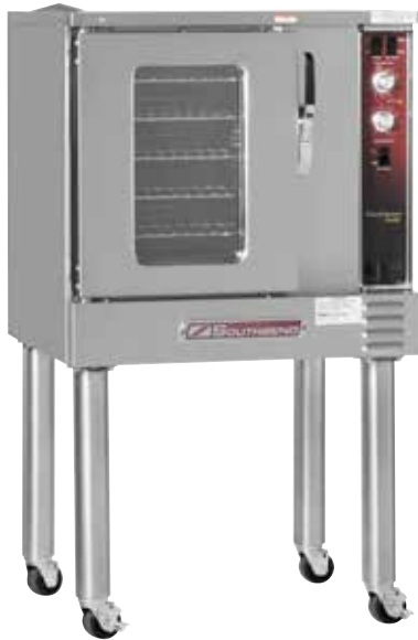
GH/10SC shown with optional legs/casters