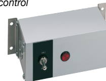
RMB-3F with toggle switch and indicator light