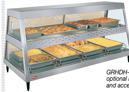
GRHDH-4PD with pan rail, optional mirrored glass doors and accessory food pans