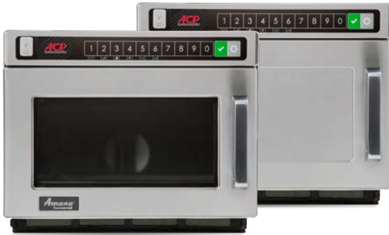
Left to right: HDC window door style and HDC solid door style (HDC18SD2)