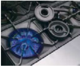
35,000 BTU/hr. (10 KW) anti-clogging, removable burner.

IHR-2-1HT IHR-4-1HT-XB IHR-2-1HT-C IHR-4-1HT-M IHR-2-1HT-XB IHR-3HT-3 IHR-2-1HT-M IHR-3HT-3-C IHR-4-1HT IHR-3HT-3-XB IHR-4-1HT-C IHR-3HT-3-M