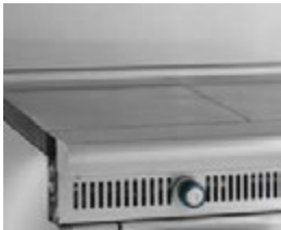
Even heating across entire Hot Top surface.