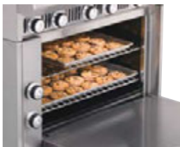
Accommodate sheet pans front-to-back and side-to-side.