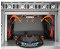
"M" shaped burner for even heating throughout the oven cavity.