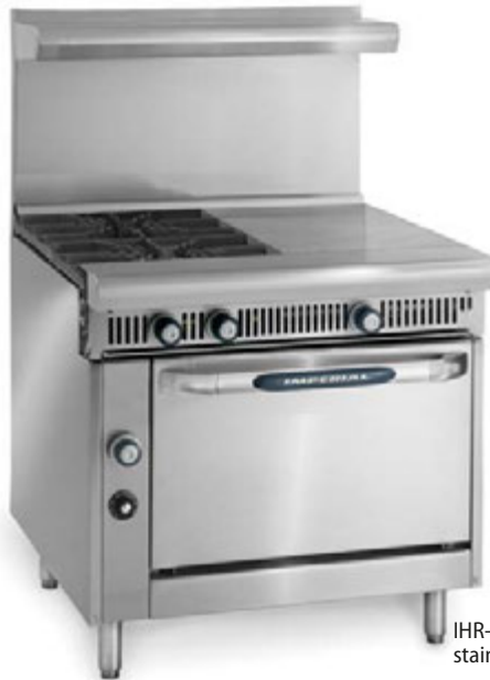
IHR-2-1HT shown with optional stainless steel backguard and shelf