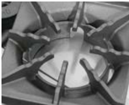
Wavy grates raise pan creating more heat transfer than direct metal-to-metal contact.