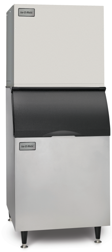
MFI2306 ON B55