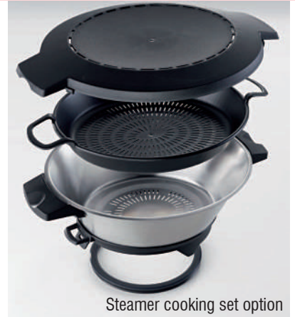
Steamer cooking set option