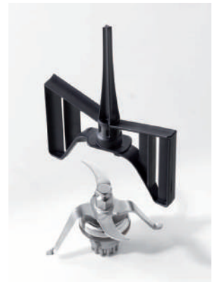
Butterfly mixer and knife hub