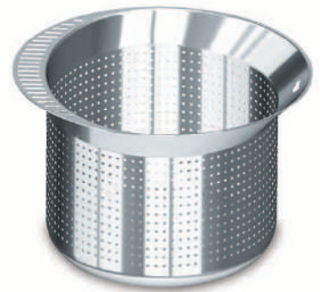
Pierced basket optional