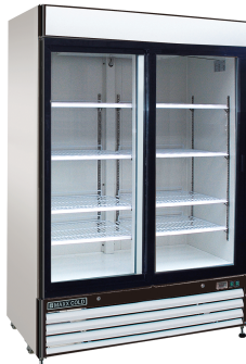
MXM2-48RS (Door: Sliding) IMAGE SHOWN MXM2-48RSB (Color: Black Door: Sliding)

Glass Door merchandisers are designed for durability and visual appeal in promoting your product. Glass door merchandisers are energy efficient and effective at keeping product at exactly the right temperature. This keeps food fresher for longer. The simple-to-use but precise digital controls allows for accuracy in temperature and flexible use of the unit.