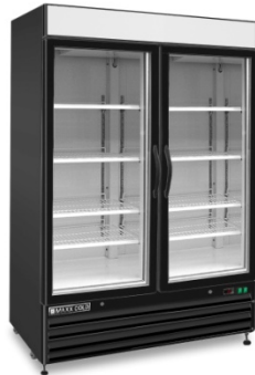
MXM2-48RB (Color: Black)