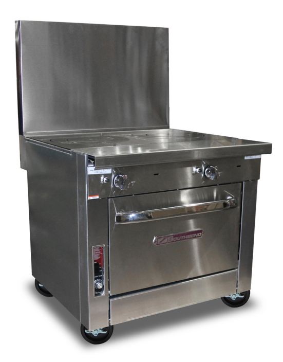
Model P36A-FF with optional 24" flue riser