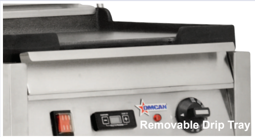
Removable Drip Tray