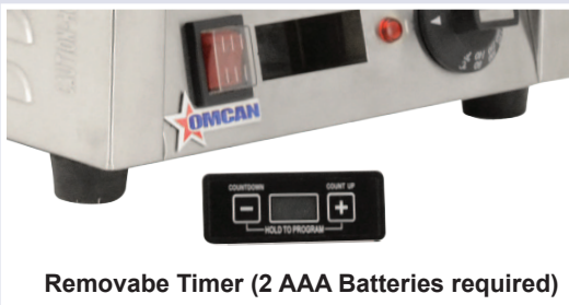
Removabe Timer (2 AAA Batteries required)