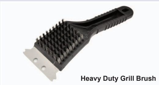
Heavy Duty Grill Brush