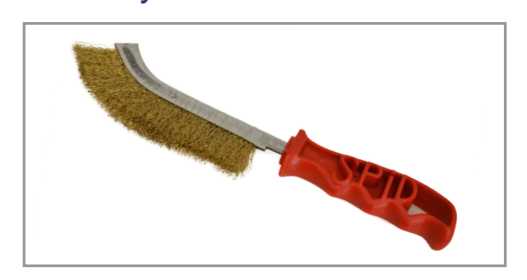
Panini Grill Cleaning Brush