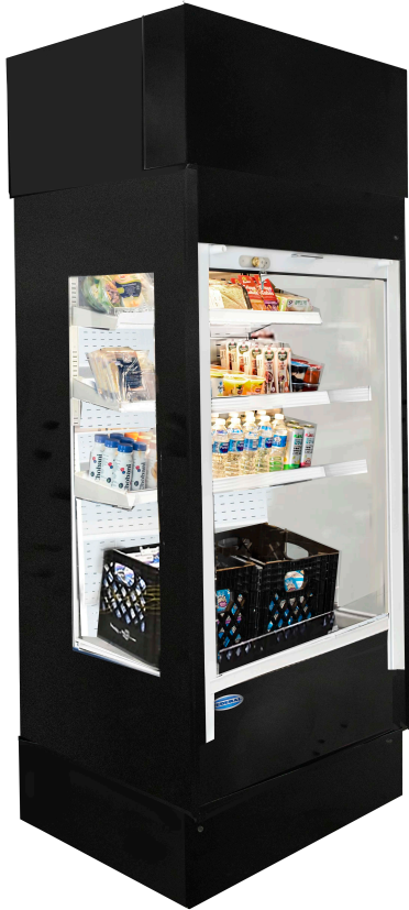
Model RSSM378-MLK Shown

Designed with school nutrition in mind. Get maximum return from an attention-grabbing merchandiser and increase profits..