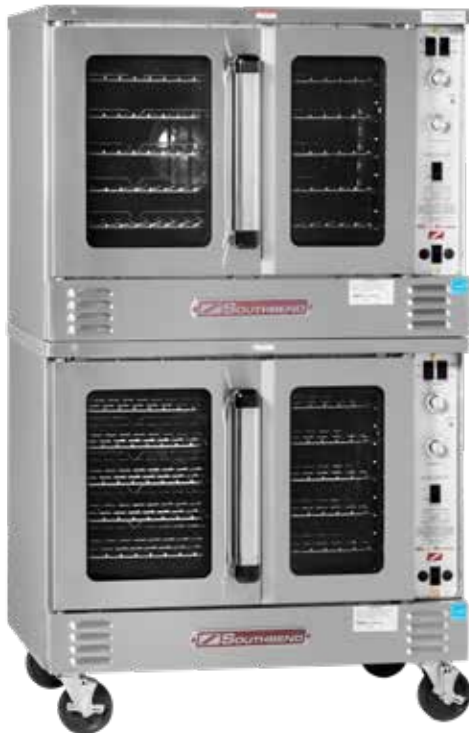
SLES/20SC shown with optional casters