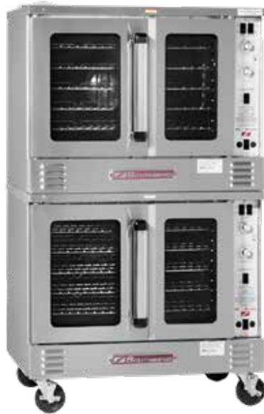
SLGS/22SC shown with optional casters

OPTIONAL NRG System required for rebates. NRG System units are Energy Star Approved. (Standard Depth Only)