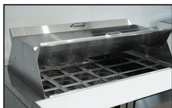
Dual Sided Lids

This product is equipped with a fine mesh filter to the front of the condenser to catch dust, and a rotating brush that moves up and down daily to remove excess buildup outward and away.