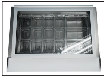
Glass Lid Top

This product is equipped with a fine mesh filter to the front of the condenser to catch dust, and a rotating brush that moves up and down daily to remove excess buildup outward and away.