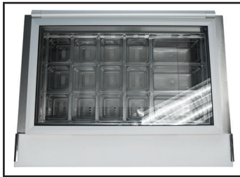
Glass Lid Top

This product is equipped with a fine mesh filter to the front of the condenser to catch dust, and a rotating brush that moves up and down daily to remove excess buildup outward and away.